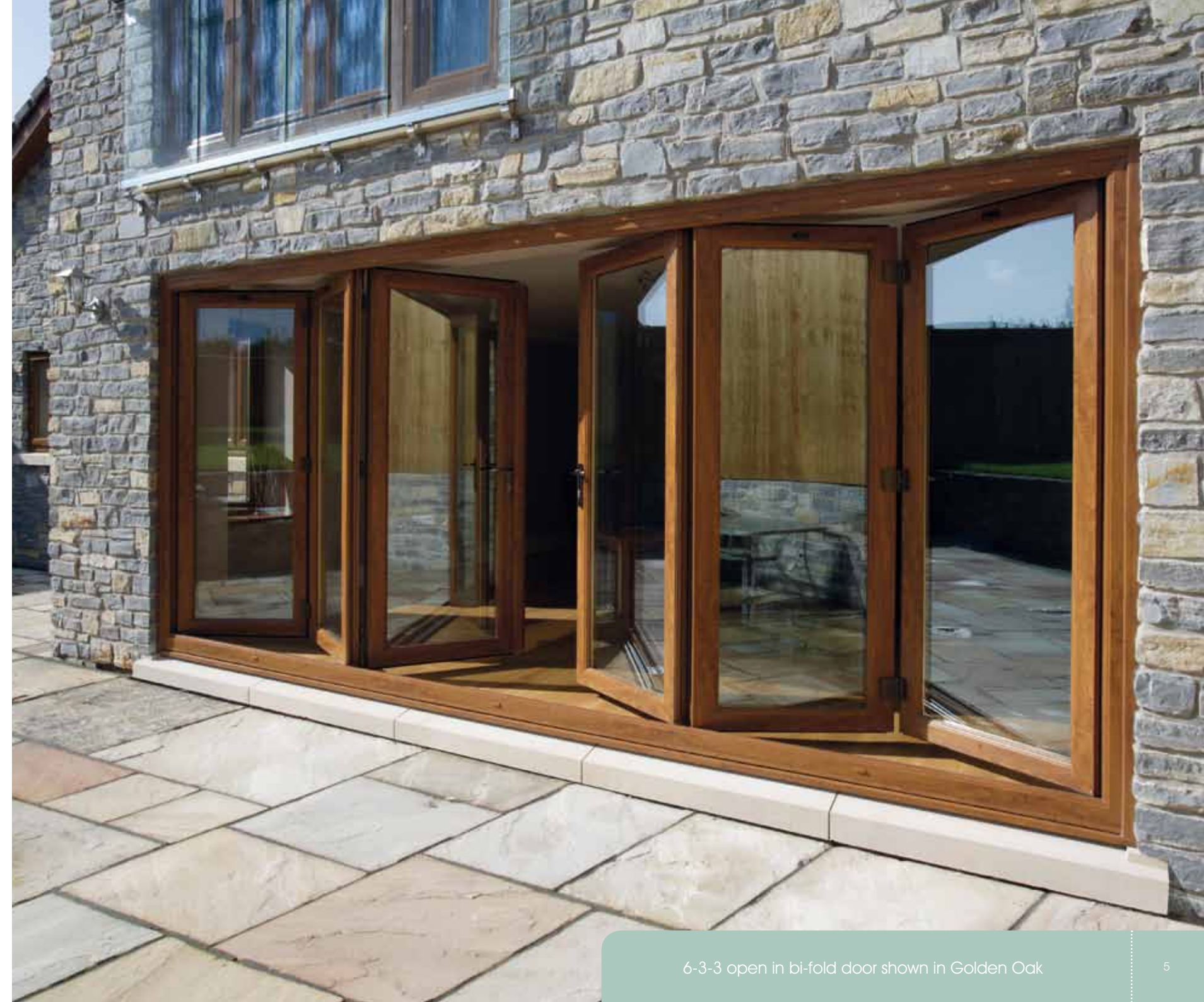
6-3-3 open in bi-fold door shown in Golden Oak

With a choice of designs and guaranteed high-quality performance, our bi-fold doors bring you the space, comfort and low-maintenance luxury of modern living. Discover why more and more people are choosing Lifestyle bi-fold doors to add that extra dimension to their homes.